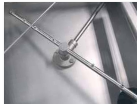
Interchangeable wash arms