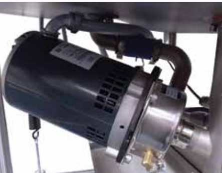
Self-draining stainless steel pump(s)