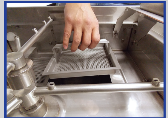
Interchangeable Scrap Baskets