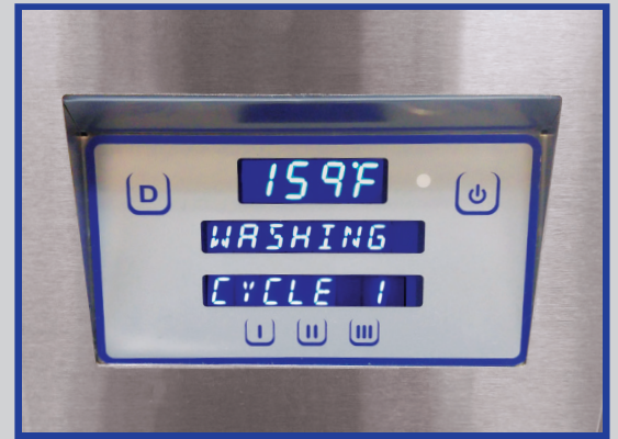
Digital LED Control Panel

Ease of serviceability is important to Jackson, and with that in mind the DynaTemp was designed to utilize common Jackson parts, as well as making service access easy. All service parts can be accessed while the unit is in place – no need to pull it from the wall or disconnect tables.