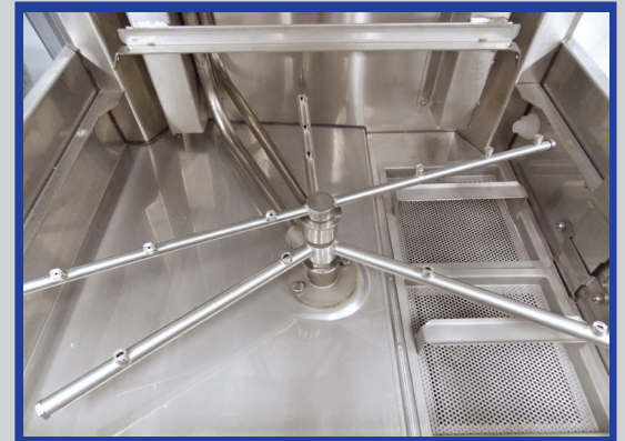
Triple Wash Arm