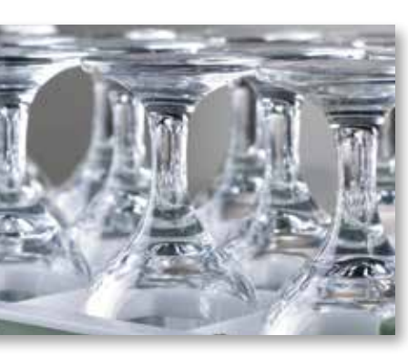
High volume capacity