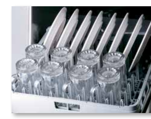
Accommodates glasses up to 11-1/2" high