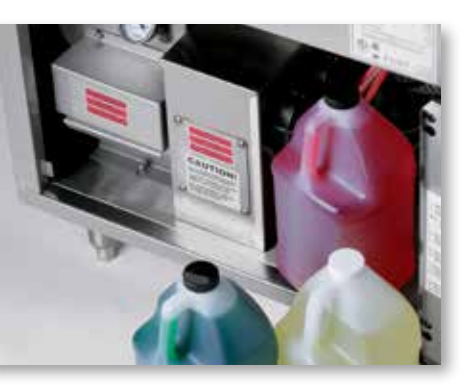
Chemical storage inside machine