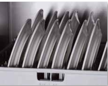
Easily accommodates wares of varying sizes