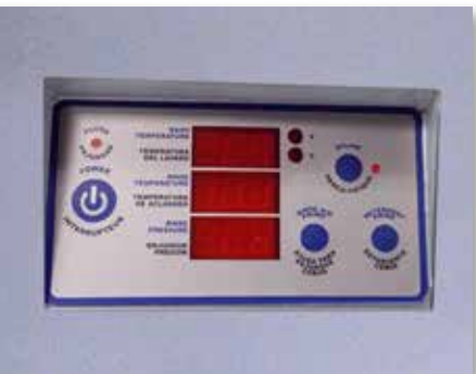
Easy to read LED display