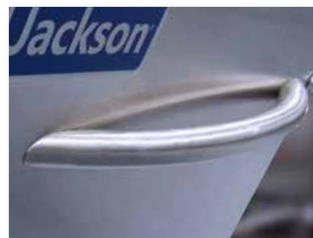
Durable stainless steel handle is contoured for a comfortable grip