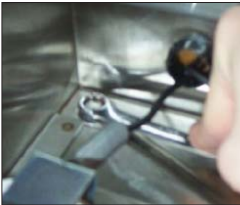
Removing bracket (control box view)

Remove the locknuts from the opposite bolts used to hold down the control box (do not remove the bolts) and secure the bracket to underside of the hood. The folded part of the bracket should be facing the rear of the machine. Immediately tighten down the locknuts.