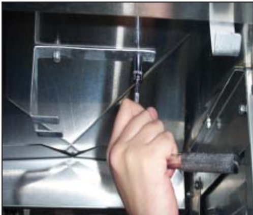
Removing bracket (bottom view)

a 7/16" combination wrench or 7/16" nutdriver will be required in order to hold the bolt head inside the control box.