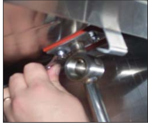
Removing the locknuts from the rinse manifold mounting bracket

12. Remove the nuts from the rinse manifold mounting bracket located on the underside of the hood. These nuts are mounted directly to the rinse injector weldment on the hood top.