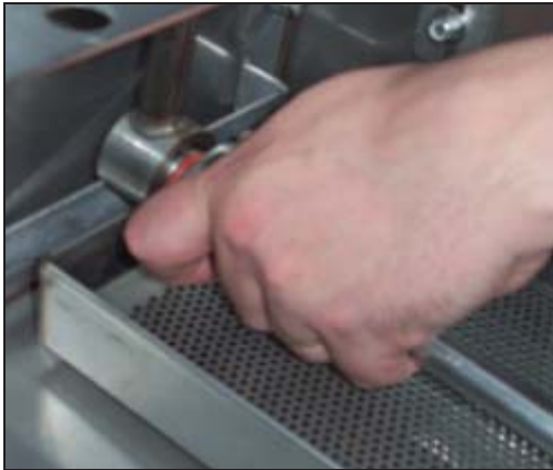
Unscrewing and removing the lower rinse arm

10. Remove the lower and upper rinse arms by unscrewing them and then gently pulling them out.