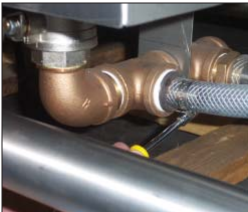
Loosening the rinse drain hose from the rinse drain nipple

16. On the drain plumbing, the rinse drain tube needs to be removed from the plumbing, as well as the wash drain tube. Both of these tubes are secured with hose clamps. Loosen the hose clamps and pull the tubes off.