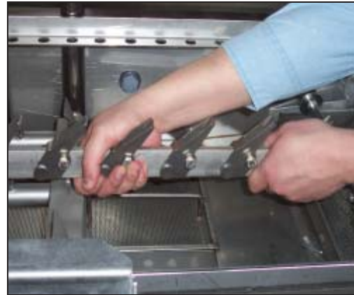
Remove the pawl bar by grasping firmly and lifting up.

6. Remove the pawl bar and set to the side.