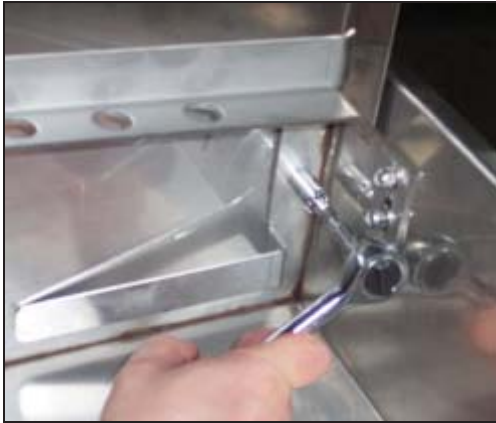
Removing a rinse tray guide bracket

16. On the drain plumbing, the rinse drain tube needs to be removed from the plumbing, as well as the wash drain tube. Both of these tubes are secured with hose clamps. Loosen the hose clamps and pull the tubes off.