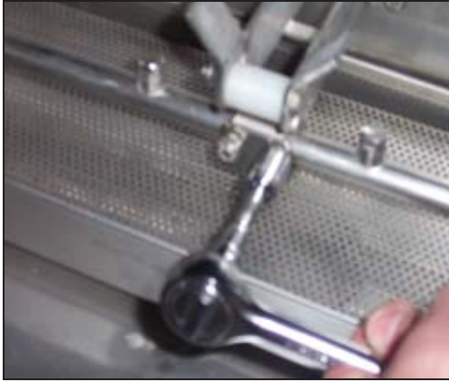
Removing the lower rinse arm support bracket

9. Remove the lower rinse arm support bracket, which is mounted directly opposite of the lower wash arm support bracket.