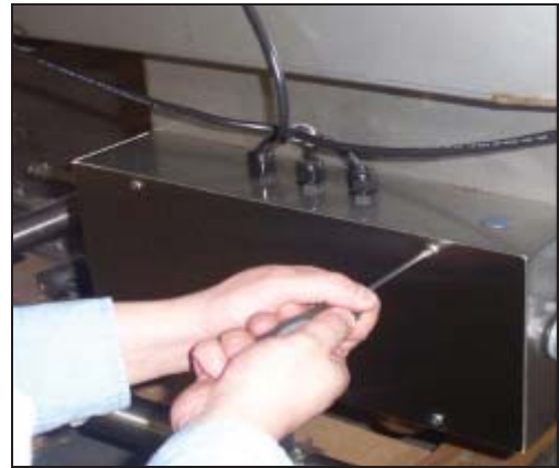
Removing the heater box cover

33. Remove the heater box cover by unscrewing the four screws holding it on.