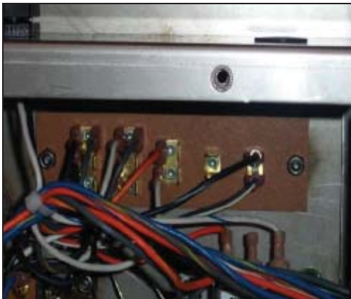
Terminal board inside the heater box

There is no need to remove the switches, only to change the wiring inside the heater box.