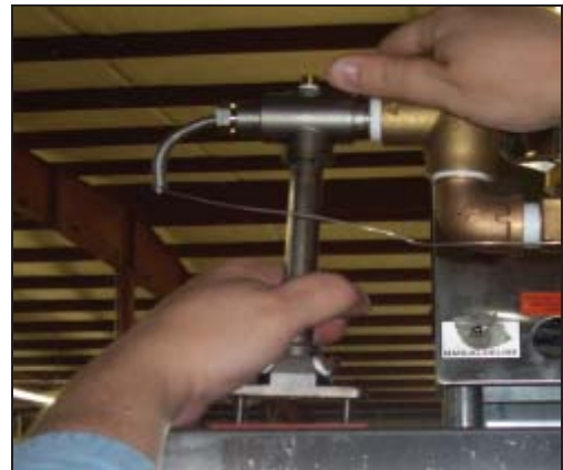
Lifting the rinse injector to make room

13. The rinse manifold must be removed. This may prove difficult while the rinse injector is still mounted. With great care, it is possible to gently lift the rinse injector off of the hood to allow the rinse manifold to be removed from the unit. Ensure that the gasket in the underside of the hood stays with the rinse manifold as it must be replaced when re-installing the manifold. If the gasket becomes lost or torn, order a new one immediately.