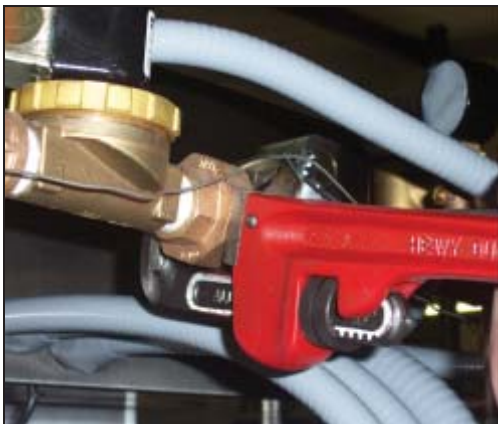
Loosening the union on the incoming plumbing

22. Separate the rinse plumbing from the rest of the incoming plumbing by loosening the union. Ensure that the gasket on the bottom of the rinse injector stays with the assembly as you remove it.