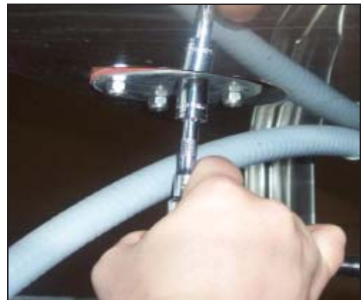
Removing the rinse drain plug

19. Reconnect the rinse drain hose and the wash drain hose to the drain plumbing.