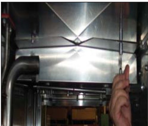
Removing and turning splash shield

5. Remove the splash shield, which is bolted to the underside of the hood next to the wash manifold and turn it 180°.