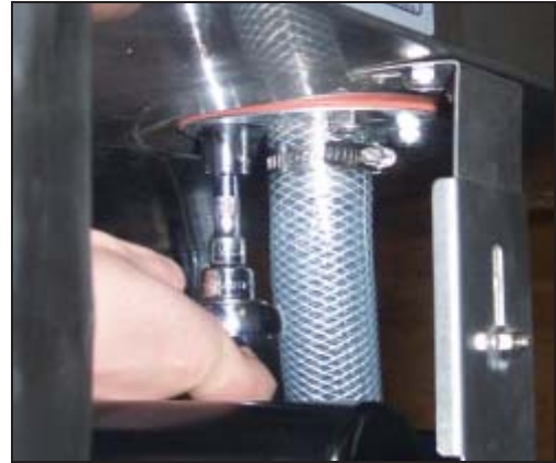
Removing the rinse drain weldment

18. On the underside of the tub, remove the rinse drain weldment and the rinse drain plug. Switch their locations so that the rinse drain weldment is in the spot that the rinse drain plug was in.