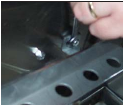
Removing the bracket nut

11. Behind the rinse manifold, remove the nut on the bracket.