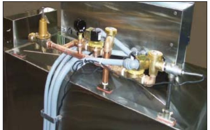
Incoming plumbing assembly for a Right to Left machine (note hole cover weldment in upper left corner)