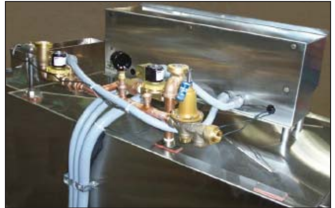
Incoming plumbing assembly for a Left to Right machine (note hole cover weldment in lower right corner)

35. Verify that the plumbing has been reassembled correctly and that the hole cover weldment has been replaced and none of the gaskets are torn or pinched as this could lead to leaking when the machine operates.