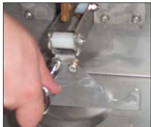
Removing the locknuts for the lower wash arm support bracket.

8. Remove the lower wash arm support bracket. Place it to the side with its locknuts.