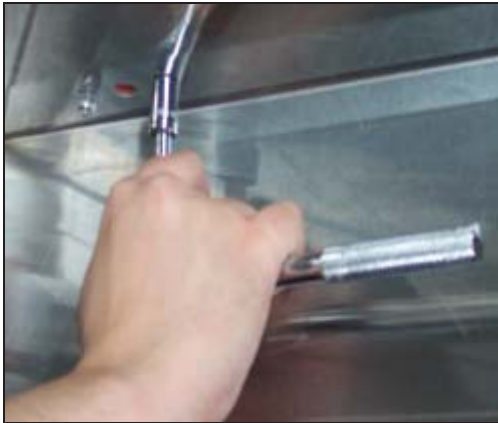
Removing the hole cover weldment

tor weldment. Once removed, set to the side along with its gasket.