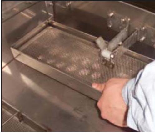
Lifting out the rinse tray assembly