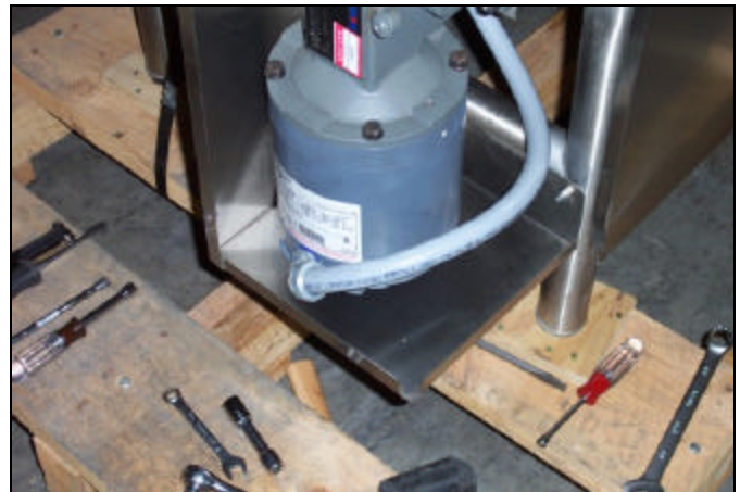
The WRONG way to mount the drive motor.