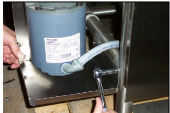
The Correct way to mount the drive motor.

17. The drive motor now needs to be reattached to the gear reducer. There are two methods for doing this. The first is to try and reinsert the drive motor shaft into the gear reducer with it (gear reducer) still attached to the unit. This is difficult but possible. Ensure that the key is in the keyway when you mate the parts. The second method and perhaps the easiest is to remove the gear reducer, mate the two parts and bolt them together and then put them on the unit at one time. This method takes a little more time. If you wish to remove the gear reducer and assemble the two components continue on to step 27.