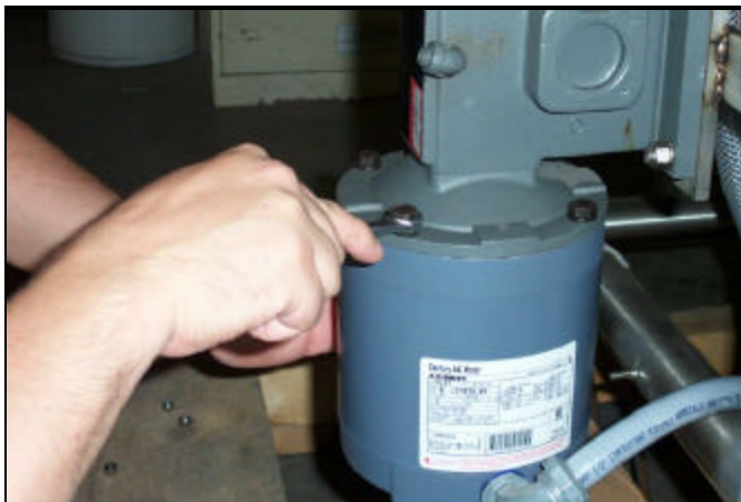
Removing the bolts holding the drive motor to the gear reducer.

5. With the cover removed you may now remove the bolts used to connect the drive motor to the gear reducer. Note: you need to support the motor as you remove the bolts; failure to do so could result in the motor falling to the ground and becoming damaged.