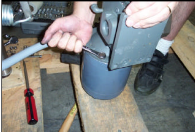
Tightening the bolts to secure the drive motor to the gear reducer.

30. Once the motor is securely fastened to the gear reducer, carefully lift the assembly up and mount it on the fasteners. Be sure to use proper lifting techniques to prevent injury.