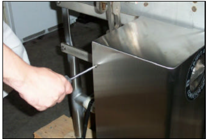
Removing the screws from the top cover.

1. Remove the (2) screws that secure the top drive assembly cover in place.