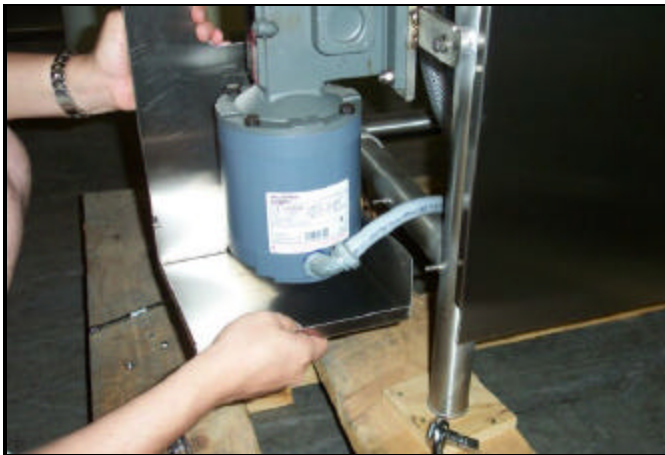
Removing the bottom cover.

4. Remove the bottom and set to the side so that it does not become a trip hazard.