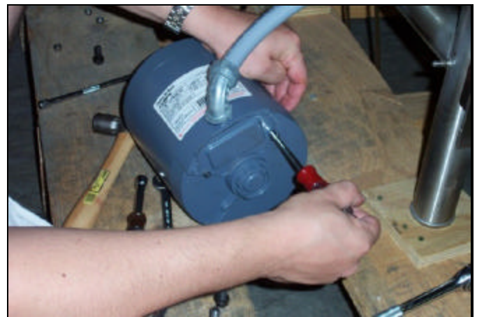
Removing the wiring access cover.

8. With the motor laying on a level surface, you need to remove the conduit from it. First, use the 1/4" nutdriver to remove the wiring access cover on the back of the motor.