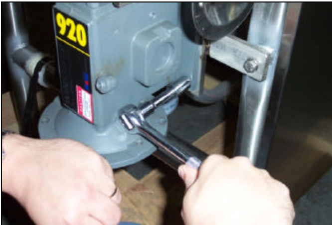
Removing the nuts holding the gear reducer on.

23. Remove the gear drive by using the 9/16" socket and ratchet, as well as the combination wrench as required, to remove the nuts holding it to the mounting plate.