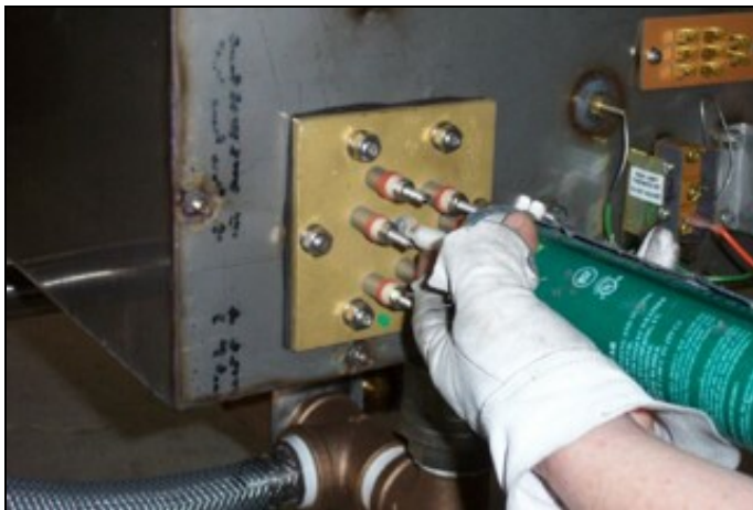
Applying silicone to the heater well

14. Apply silicone to seal the well and hold the thermostat probe in place.