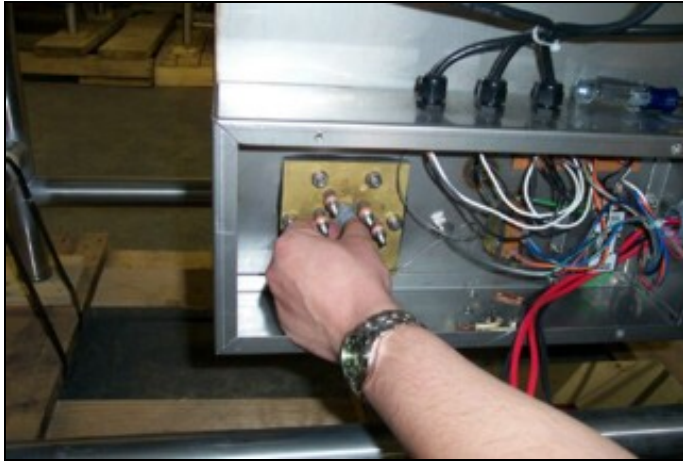
Removing silicone from thermostat well