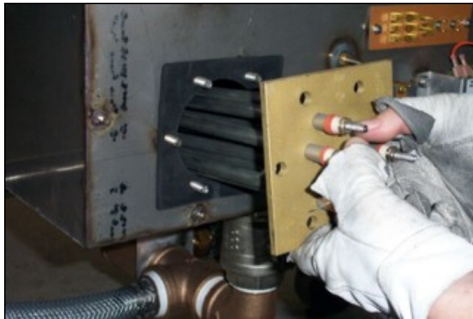
Removing the heater

8. Remove the heater from the tub weldment.