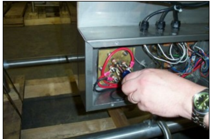
Removing the power lines.

3. Remove the incoming electrical lines from the heater. Set the hardware to the side.