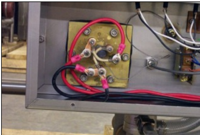
Single phase wiring

15. Reattach the incoming power lines to the heater, ensuring that you wire the heater correctly for either single or three phase operation.