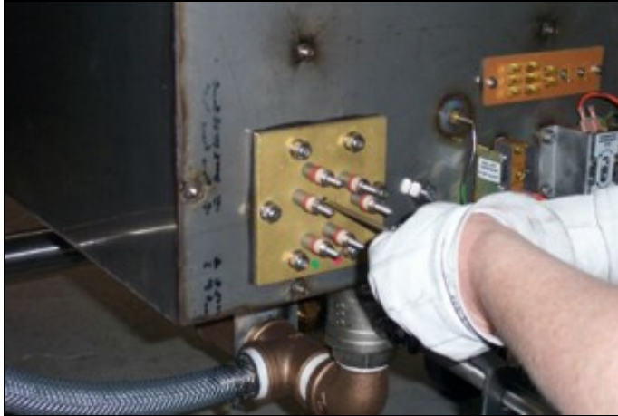
Putting the thermostat probe in the heater well