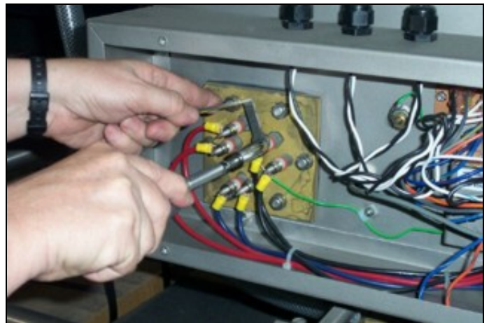
Tightening the nuts holding the power lines

16. Using the torque wrench or a torque nutdriver (if available) torque the nuts holding the wires, jumpers and bus bars to 16 in-lbs.