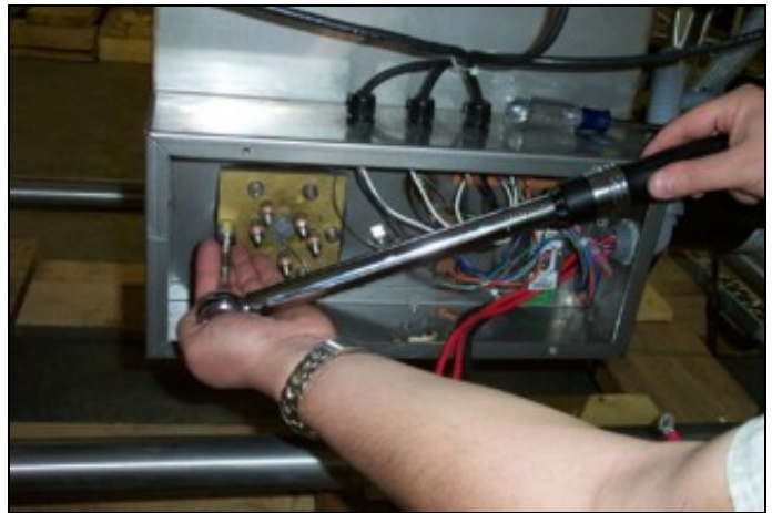
Applying the torque wrench to the nuts

12. Slide the heater onto the studs and apply by hand the lockwashers and nuts. Tighten the nuts by hand and then use the torque wrench set to 154 in-lbs to ensure that the nuts are secure.