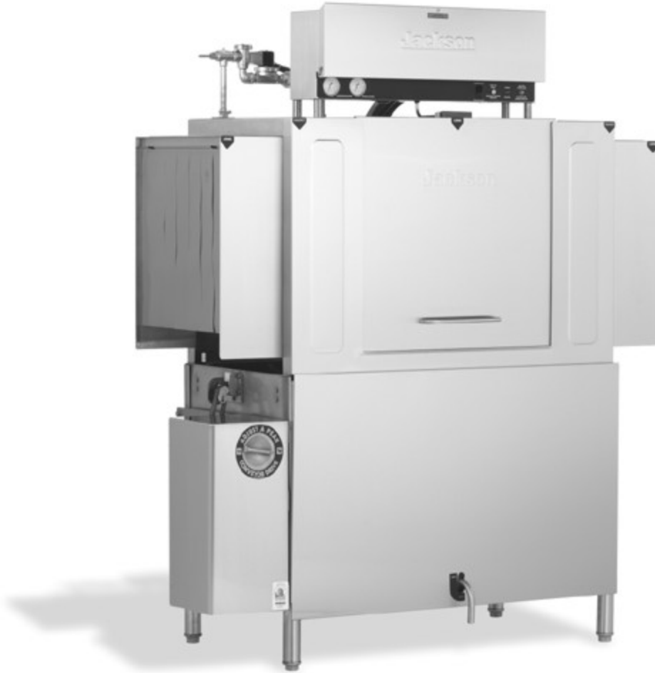
Rack Conveyor Dishmachine Maintenance Instructions