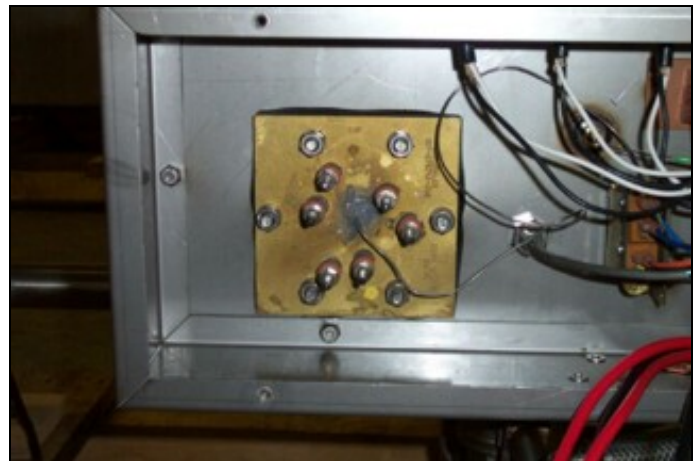
Heater without power lines attached.

4. Push the incoming electrical lines out of the way.