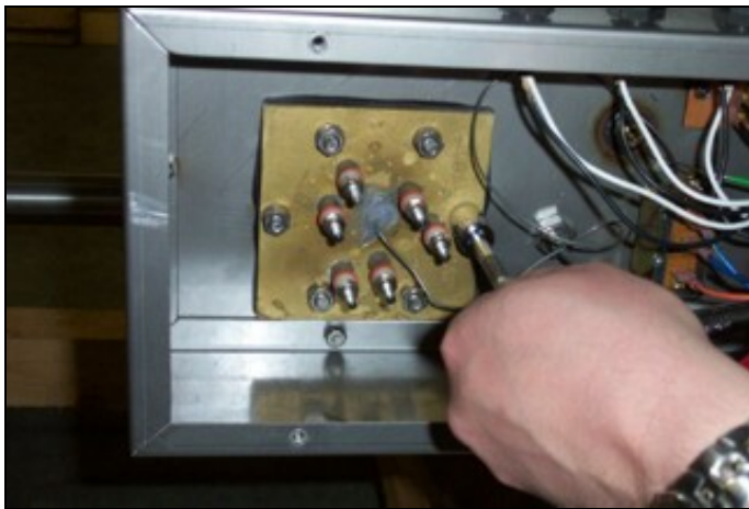
Removing the nuts and lockwashers

7. With the thermostat probe out of the way, use the 1/2" socket and ratchet to remove the nuts holding the heater to the tub. Remove all nuts and lockwashers.