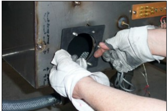
Removing the gasket

7. With the thermostat probe out of the way, use the 1/2" socket and ratchet to remove the nuts holding the heater to the tub. Remove all nuts and lockwashers.