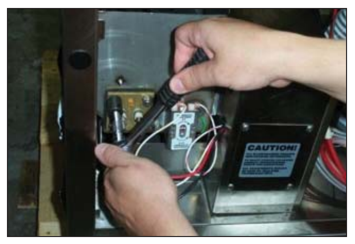
Using the ratchet to remove the heater mounting nuts.

6. Next, use the ratchet and 1/2" socket to remove the heater mounting nuts.