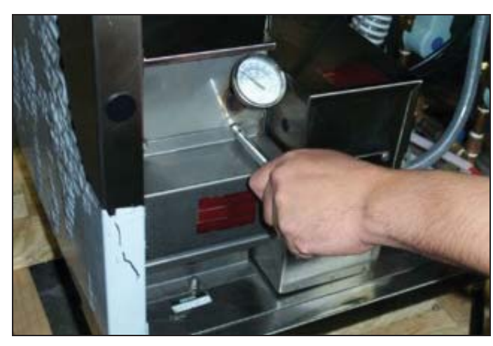
Removing the heater cover.