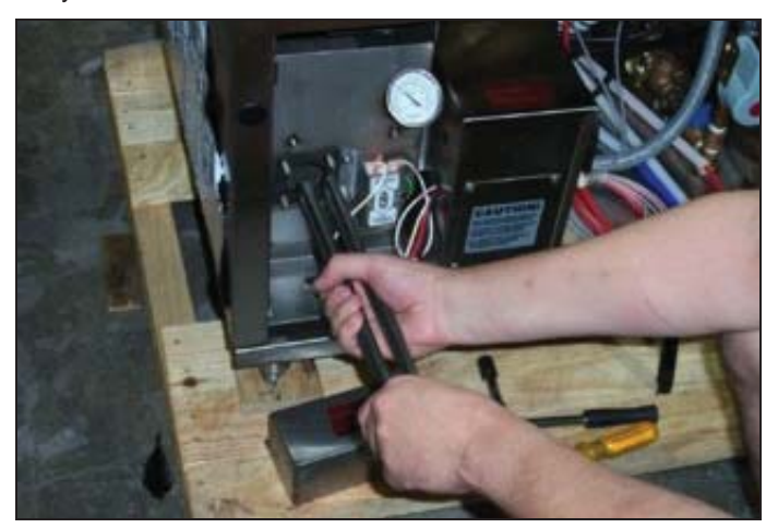
Pulling the heater out.