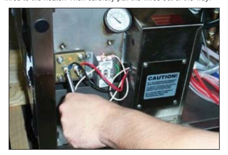
Removing the heater nuts.

5. Using the 3/8" nutdriver, remove the nuts securing the heater wires to the heater. Then carefully pull the wires out of the way.