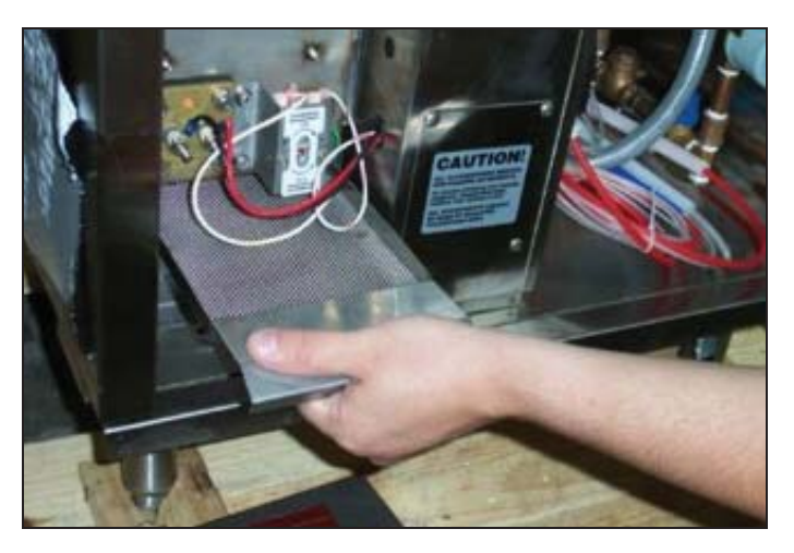
Removing the lower strainer.

4. Remove the upper (wash) strainer as well. Set both strainers to the side where they will not be damaged or present a trip hazard.