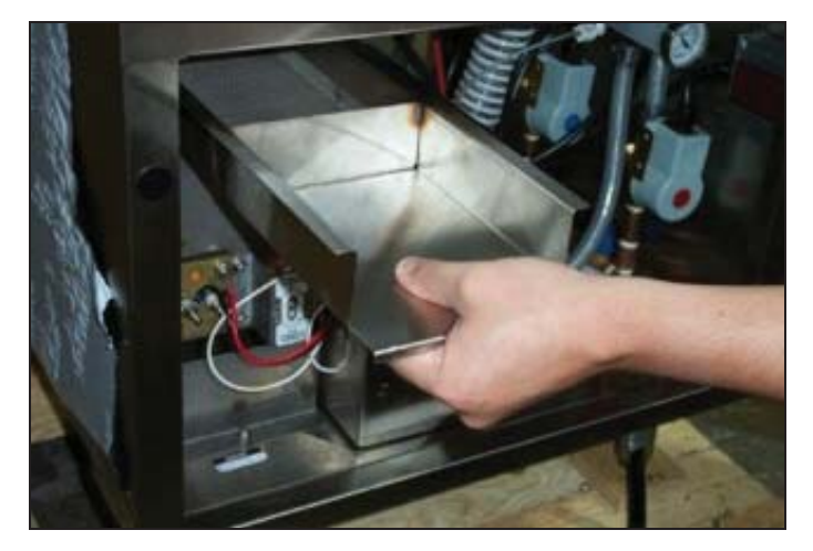
Removing upper (wash) strainer.

5. Using the 3/8" nutdriver, remove the nuts securing the heater wires to the heater. Then carefully pull the wires out of the way.