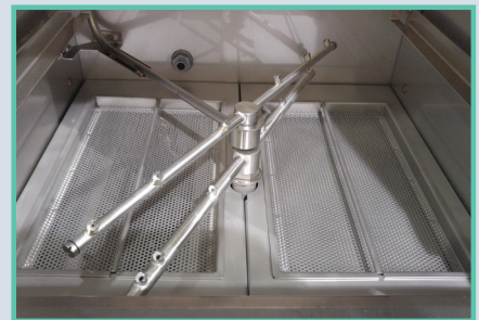
Interchangeable Scrap Baskets