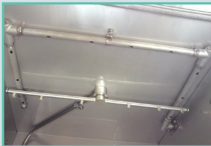
Halo Wash Arm