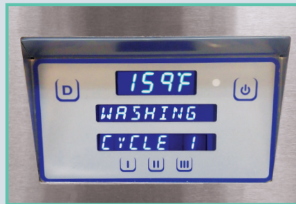
Digital LED Control Panel