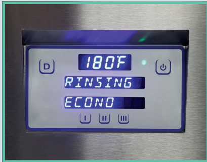
Digital LED Display