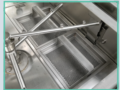
Interchangeable Scrap Baskets