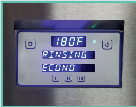
Digital LED Display