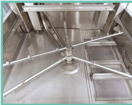
Triple Wash Arm