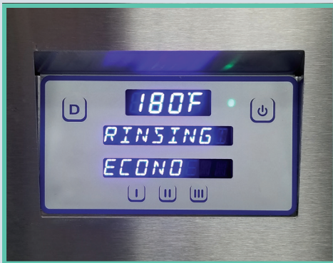
Digital LED Display