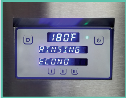
Digital LED Display